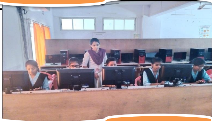
INTERNET & NETWORK LAB