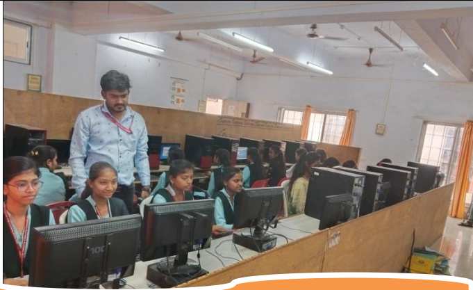
SOFTWARE TESTING LAB