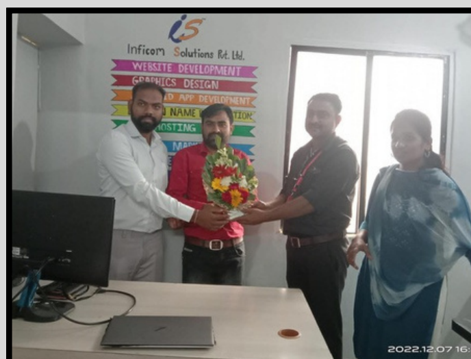
Industrial visit of Information Technology Students to Inficom Solution Pvt.Ltd, MIDC Industrial Area Aurangabad

During the visit, students were introduced to the various operations and departments within Webmaps Pvt. Ltd., including software development, project management, and client servicing. They had the chance to interact with experienced professionals who shared their expertise and experiences, giving students a clearer picture of the skills and knowledge required to thrive in the tech industry.