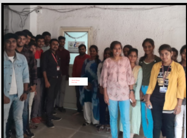
Industrial visit of Information Technology Engg. Students to Webmaps Pvt. Ltd Pune on date 21 September 2022.

During the Industrial Visits, students get to learn how professionals perform at work and they implement certain industry-specific concepts